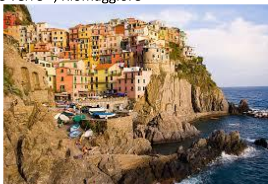
“Cinque Terre”, Manarola